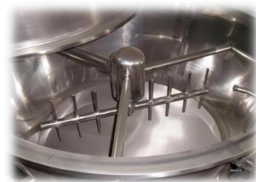
Figure 2 Drying bottom