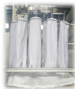
Figure 3. Bag dust collector