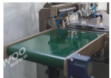
Finished production output unit