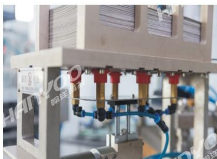
Paper card insertion unit